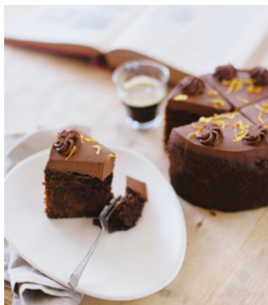
WHOLE BEETROOT CAKE