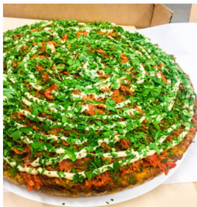
WHOLE BOMBAY TART

We are here to help you provide a delicious and nutritious offering to your friends, family, guests and corporate colleagues!