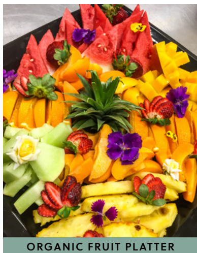
ORGANIC FRUIT PLATTER