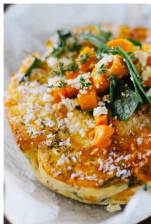
WHOLE FRITATA | SLICED FRITATA