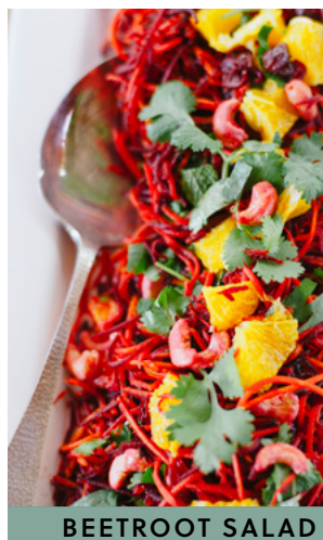
BEETROOT SALAD / ANCIENT GRAINS